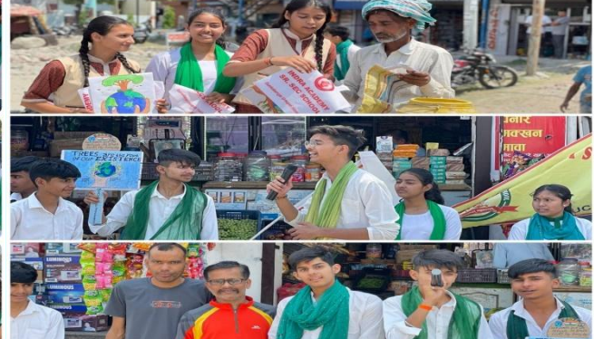
\textbf{CLASS: 11}^{\text{TH}} \ \& \ \textbf{12}^{\text{TH}}