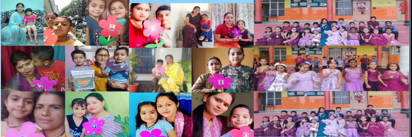
Class 3rd and 4th: Delving into the art of calligraphy , these students penned beautiful and heartfelt quotations on mothers, showcasing their admiration and respect.